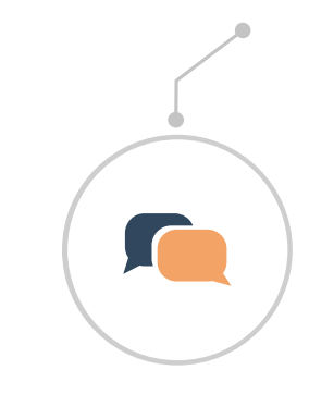
Transparency & Trust