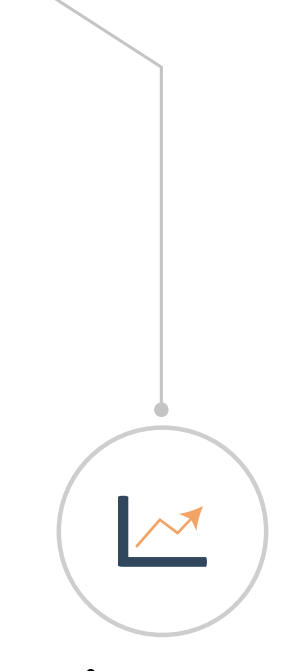
Predictable Cost Structure