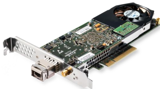
2011 World's first 40G accelerator