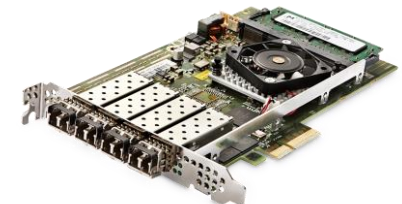
NT4E-4-STD 4-port 1G