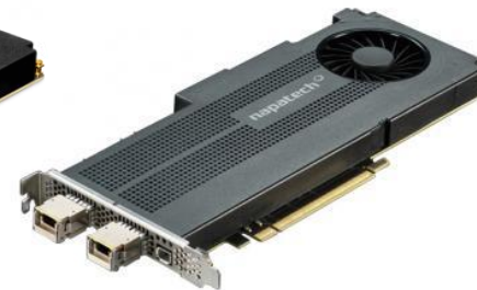
NT80E3-2-PTP 2-port 40G