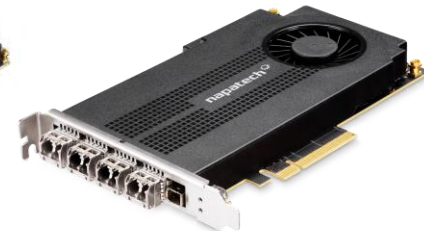
NT40E3-4-PTP 4-port 10G