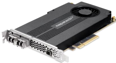
NT20E3-2-PTP 2-port 10G