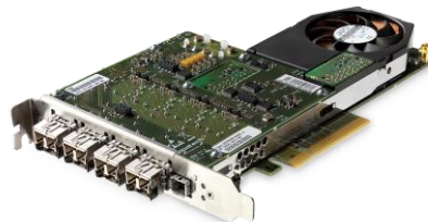
NT4E2-4-PTP 4-port 1G