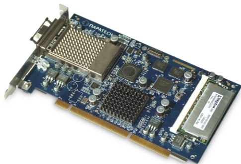
2003 World's first 10G accelerator

To keep our customers one step ahead of the data growth curve by accelerating their applications and time-to-market while reducing risk.