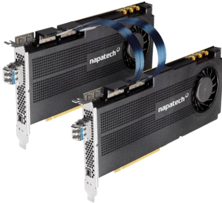
200G Performance Solution 2-port 100G