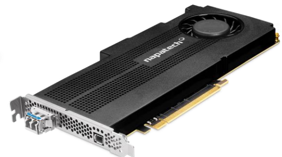
2014 World's first PCI-SIG 100G accelerator