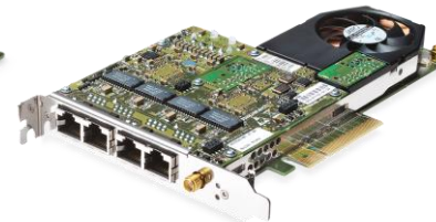
NT4E2-4T-BP 4-port 1G