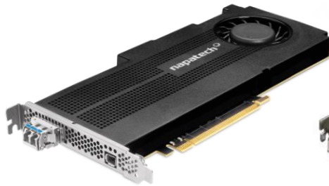
NT100E3-1-PTP 1-port 100G